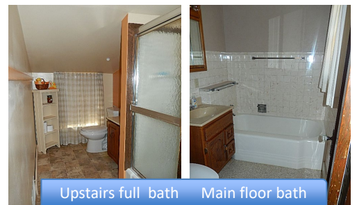
Upstairs full bath Main floor bath

402 N Main Street Chamberlain SD 57325 CHAMBERLAIN REAL ESTATE PROFESSIONALS